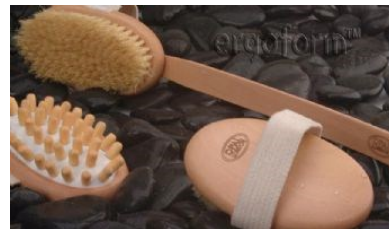
Above: Some of the brushes in Opal London's range

For long reach, this brush can also be used with the detachable handle of the Mexican fiber back brush.